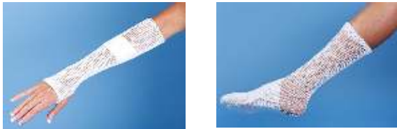
HCPCS Code A6457